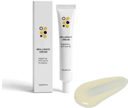
BRILLIANCE CREAM 40ml