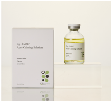
ACNE CALMING SOLUTION Clinical Size: 30mL e 1.01 fl. oz.