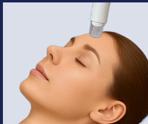
Applicator in use